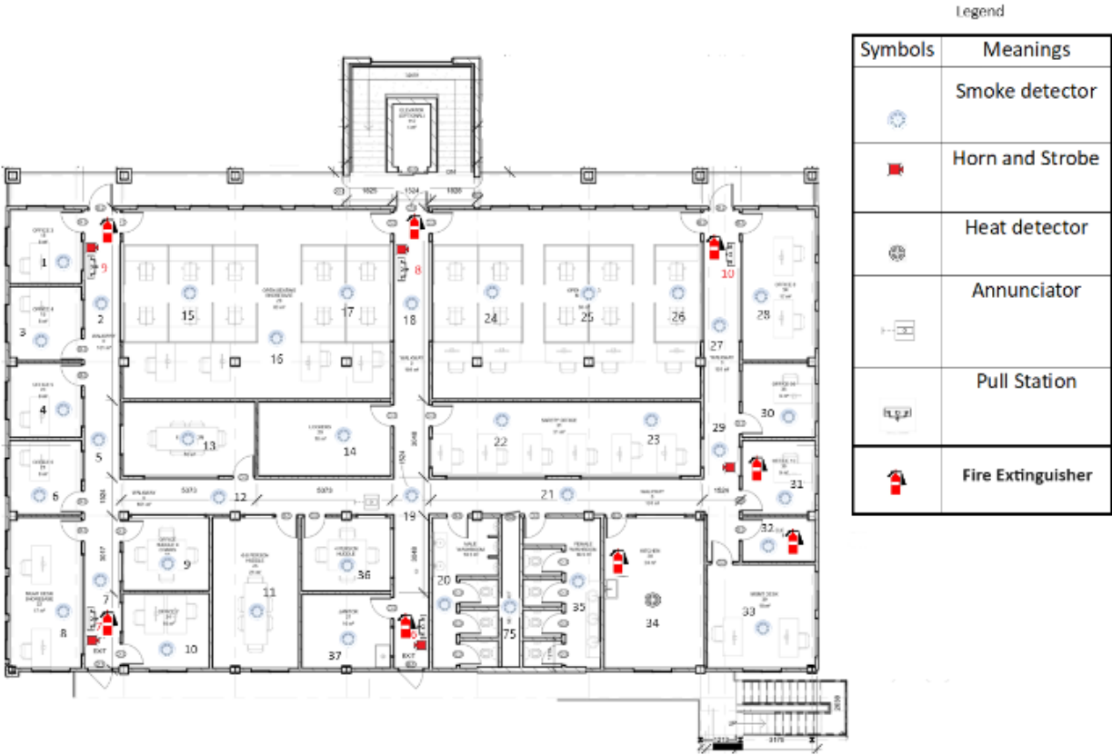
Figure 2. Second Floor Fire Alarm Layout.

Issued by: GUYANA SHORE BASE INC. (GYSBI) June 4, 2025