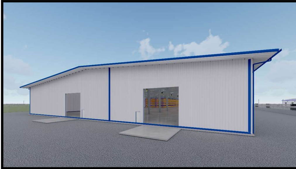
Figure 2: External concept of the warehouse extension.