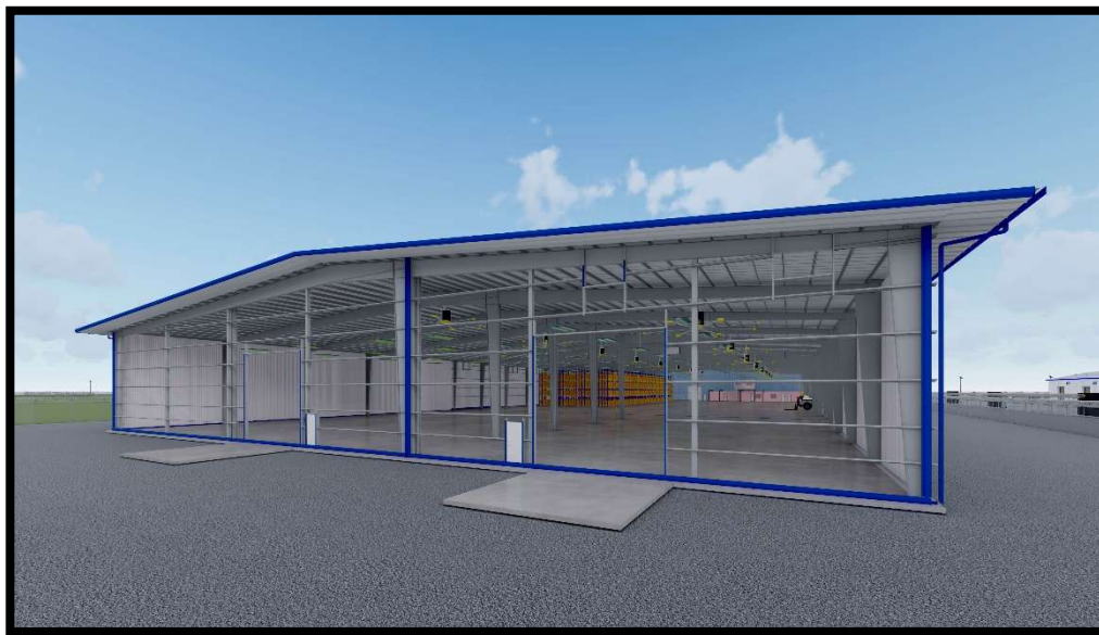
Figure 3: Internal concept of the warehouse extension

This project is to be designed and built by the Contractor using the Fixed Price Design and Build delivery method. The project scope includes engineering and design services, permitting, procurement, supply, installation, construction, operations, and maintenance (O&M) manual preparation, and start-up and commissioning services for the extended new facility. The project scope and design standards are described herein and further in the Employer's Requirements.