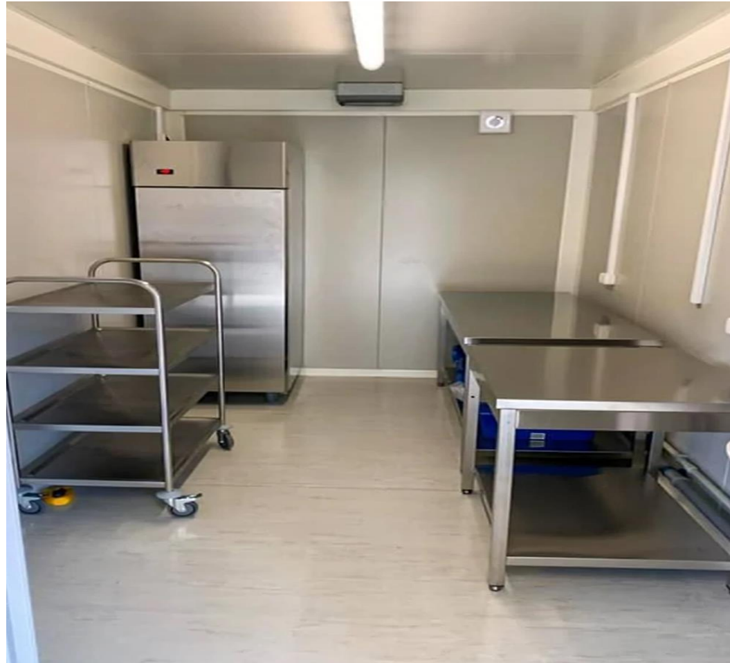
Figure 1. of Proposed Layout